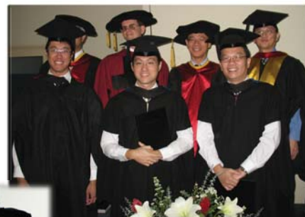
Asian Baptist Bible School graduation

who wanted to upgrade his skills. It was great to see the fruit of many years of effort. Several unsaved family and friends