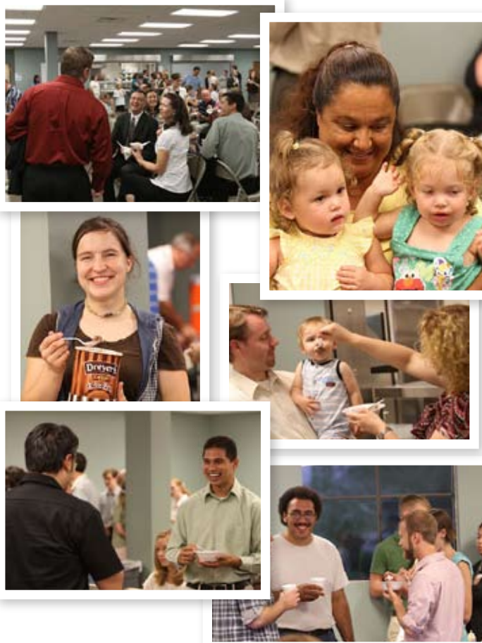
See more photos and read more about this and other events on our website.