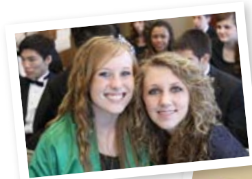
◀ Christian Schools of Arizona Fine Arts Festival & Competition March 4-5, 2010