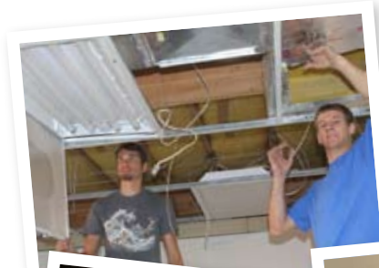
▼ Work begins on the International Baptist College Office Complex March 5, 2010