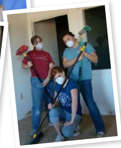
Photos may be taken at any church service or event and may be used for web or print publications. To see pictures from church events, visit our website at www.tricityministries.org