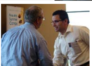
Photos may be taken at any church service or event and may be used for web or print publications. To see pictures from church events, visit our website at www.tricityministries.org